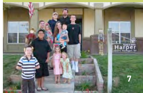
A Boys Town California family outside their newly painted Trabuco Canyon Family Home